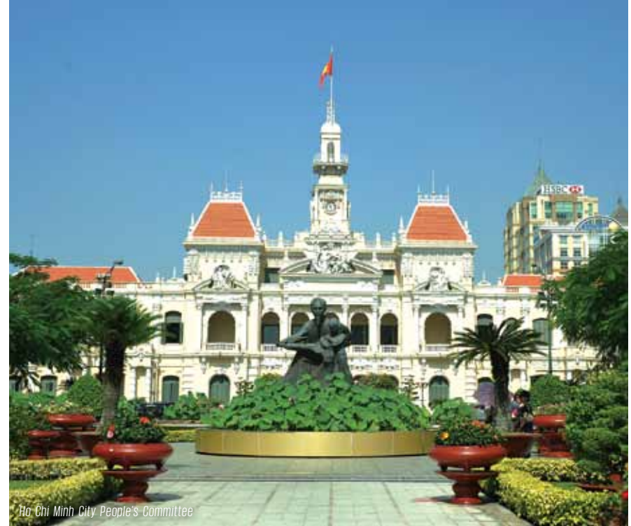
Ho Chi Minh City People's Committee

The first period of Vietnamese history spanning from 2879 B.C., when the Hung Kings founded the country in 179 B.C., was characterized by three cultural centers, which are related to one another; namely the Dong Son Culture in the Northern region, the Sa Huynh Culture in the North Central region and the Dong Nai Culture in the Southern region. Throughout more than a millennium - under Chinese domination (from 179 B.C. to 938 A.D.), under the Ngo-Dinh-Early Le-Ly Dynasties (939-1225), Tran-Ho Dynasties (1226-1407), the Vietnamese people were united together in their struggle against invaders with a view to protecting national independence and unity as well as throwing off the yoke of foreign oppression culminating in the Lam Son uprising (1418-1427), in which Minh invaders were defeated and the country's sovereignty was regained. Under the Le So-Mac-Le Trinh and Nguyen Lords (1428-1788), it moved southwards, reclaiming land. In the period from 1771 to 1802, the Tay Son dynasty expelled invading foreign powers and unified the country. Under the Nguyen Dynasty (1802-1945), the resistance war against French colonialists spread far and wide. In 1945, under the leadership of President Ho Chi Minh, seizing historical opportunities, the Vietnamese people staged the August Revolution by successfully launching general uprisings to seize power. With the