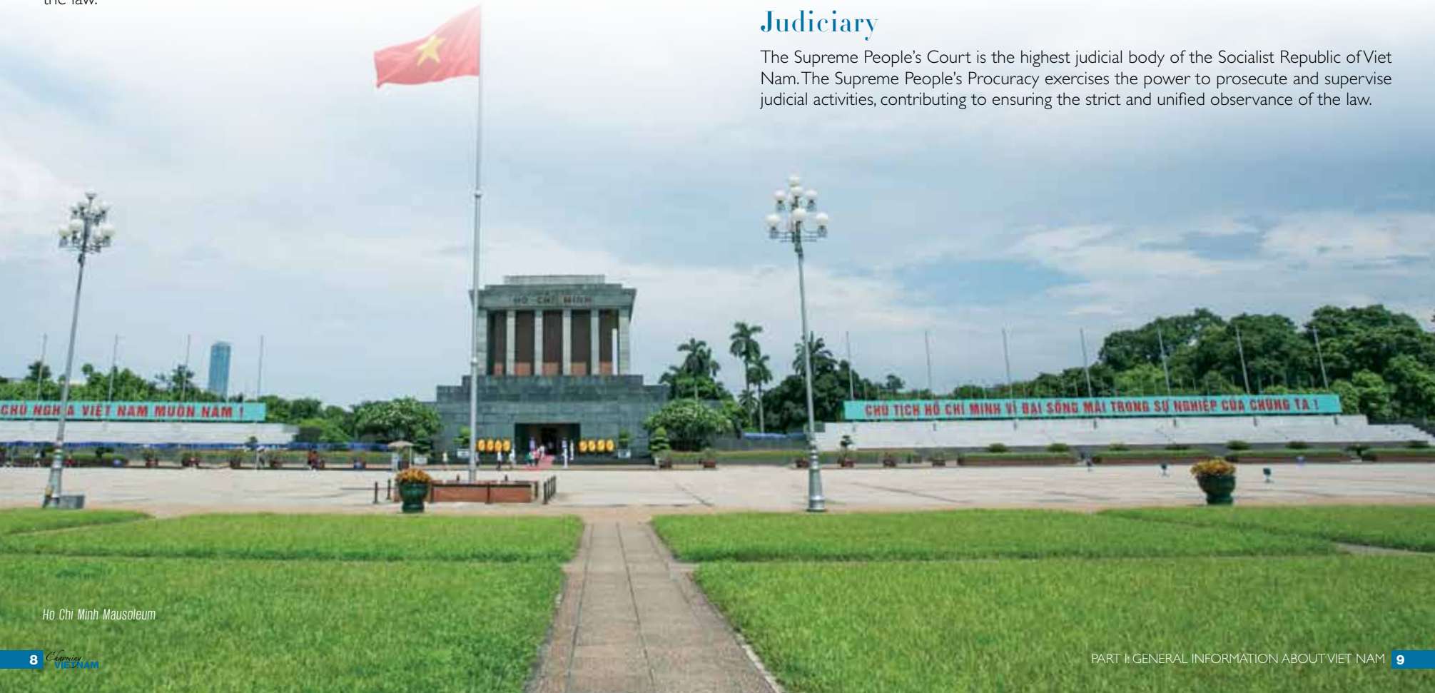
Ho Chi Minh Mausoleum

The Supreme People’s Court is the highest judicial body of the Socialist Republic of Viet Nam. The Supreme People’s Procuracy exercises the power to prosecute and supervise judicial activities, contributing to ensuring the strict and unified observance of the law.