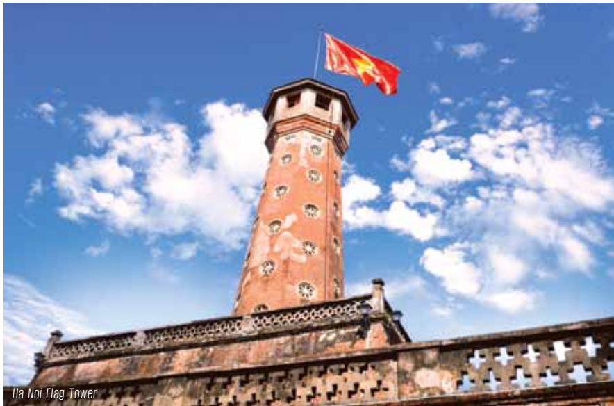
Ha Noi Flag Tower

Viet Nam has a history of over thousands of years of national construction and defense. Throughout history, Vietnamese people have been characterized by strong vitality, patriotism, love for peace, independence and freedom, indomitable tenacity in fighting against invaders and their dynamism, creativeness in building and developing the country.